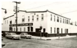
Warehouse and shipping building at 2nd and Columbia in Philadelphia

Due to his ongoing interest and innovative approach to coupling design, he started the Dixon Valve and Coupling