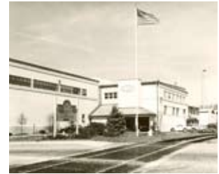
Chestertown, Maryland manufacturing facility

In 1976, the Dixon Group moved its headquarters and the largest USA manufacturing base to Chestertown Maryland, where it remains today.