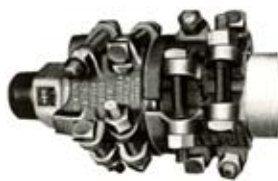
Rotary Hose Coupling